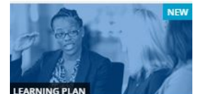
Club President Basics

Please submit your completed course certificate to your District Governor Elect No later than 01/15/2020